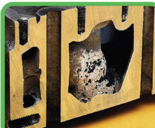
Severe corrosion which can occur when additives have been depleted.

BG Cooling System Service removes harmful deposits and protects the entire cooling system