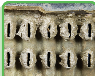
Rust, scale and sludge can plug cooling system fins, preventing proper circulation of coolant.