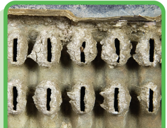
Rust, scale and sludge can plug cooling system fins, preventing proper circulation of coolant.