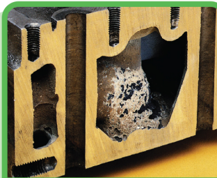
Severe corrosion which can occur when additives have been depleted.

BG Cooling System Service removes harmful deposits and protects the entire cooling system