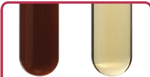
Brake fluid before (left) and after (right) service.

BG Brake Service helps prevent unexpected failure on your vehicle's most important safety feature